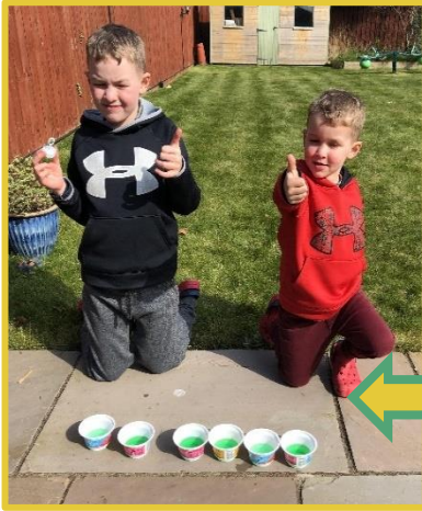
6. Time to report your results.