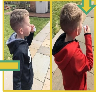
4. Try your bubbles out!