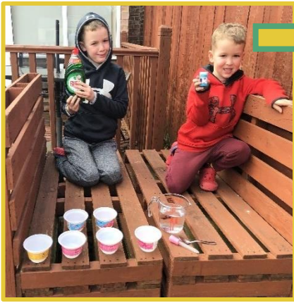
1. Get your equipment ready.