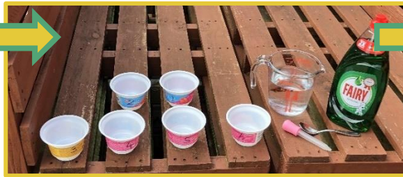
2. Check you have everything you need.