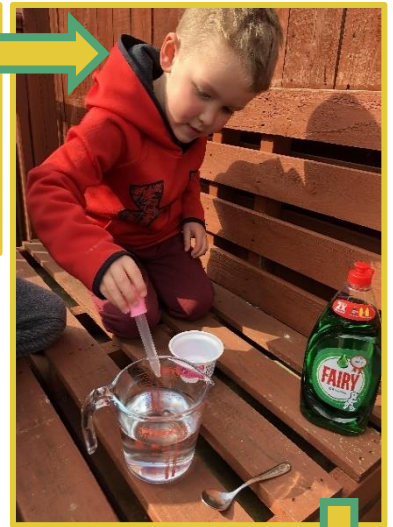
3. Measure out your ingredients.