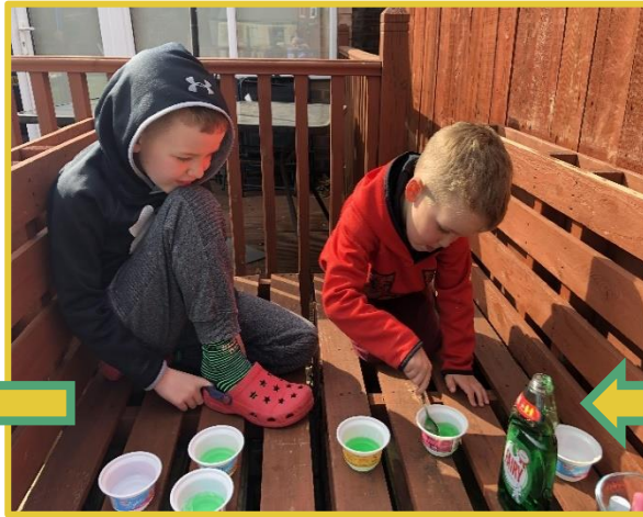
5. Adjust your recipe and try again.